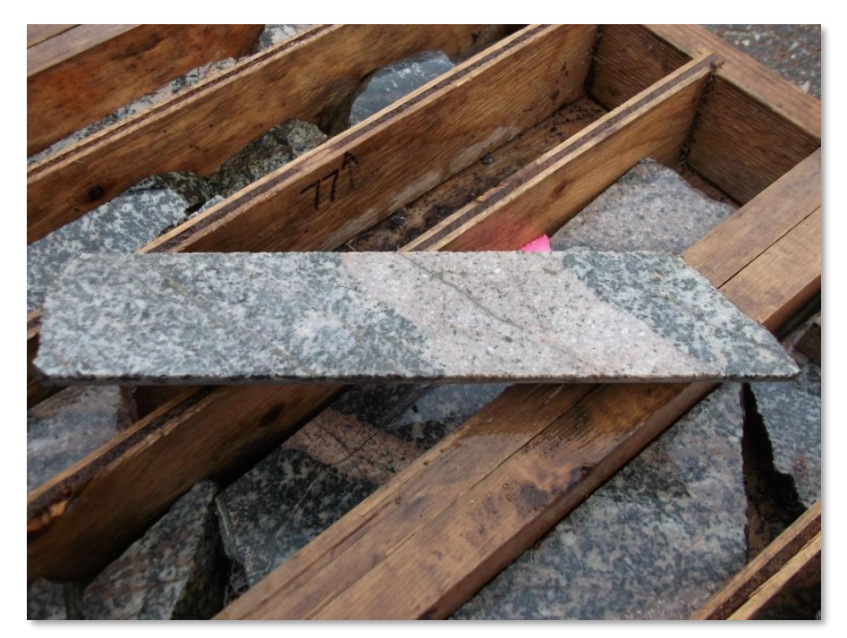
Porphyry intrusion and copper-gold mineralization in DDH-2007-2 @ 77m associated with sheeted quartz-sulphide veining