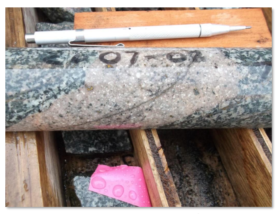
Porphyry intrusion in DDH-2007-2 @ 77m with chalcopyrite as blebs, disseminations and veinlets (note emplacement of sheeted quartz veins appears to precede emplacement of porphyry)