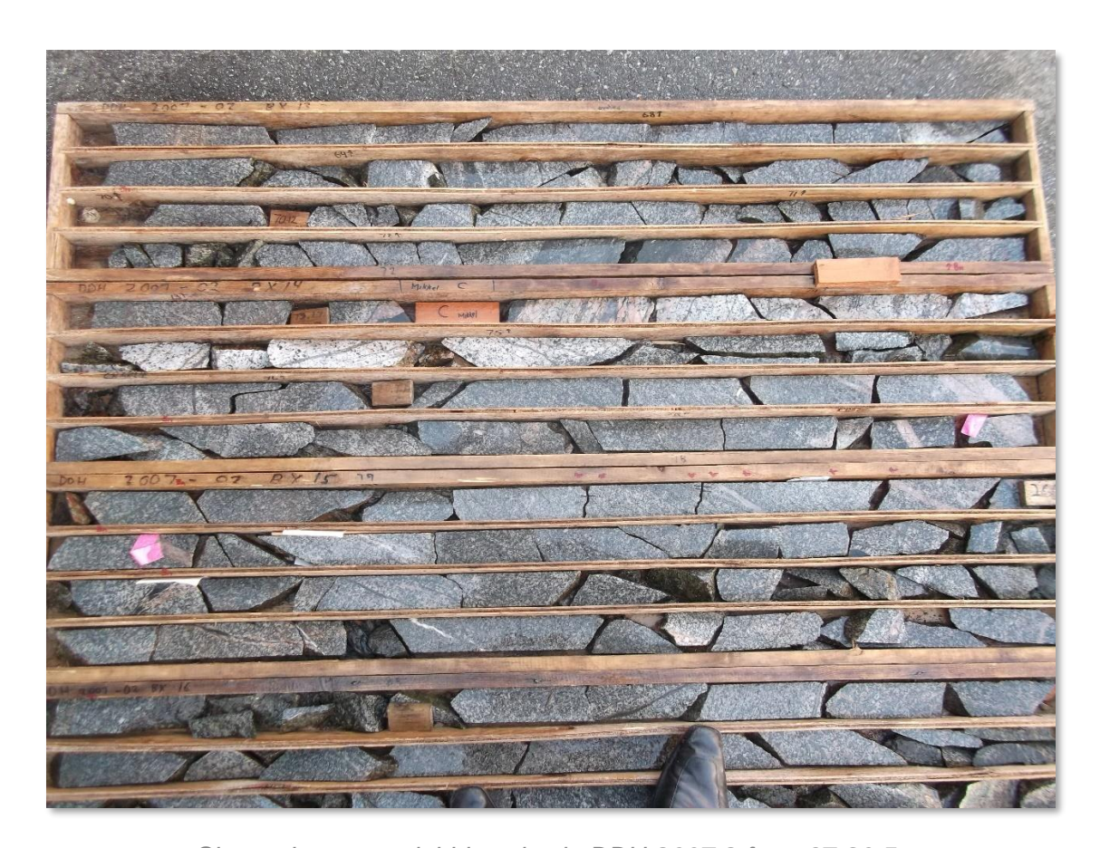
Sheeted guartz-sulphide veins in DDH-2007-2 from 67-90.5m